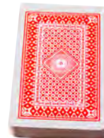
Deck of Cards

The pictures to the right show some common items and compares them to serving sizes. Be aware of what you are putting on your plate.